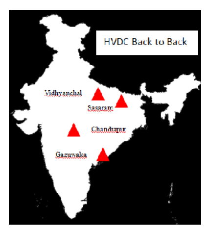
Fig. 3. HVDC Back to back Stations.

There are currently four operational back to back projects in India namely, Vidhyanchal Back to Back, Chandrapur Back to Back, Sasaram Back to Back and Gazuwaka Back to Back.