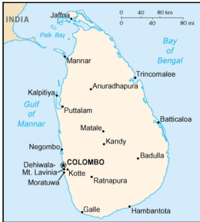
Figure 10: Map of Democratic Socialist Republic of Sri Lanka