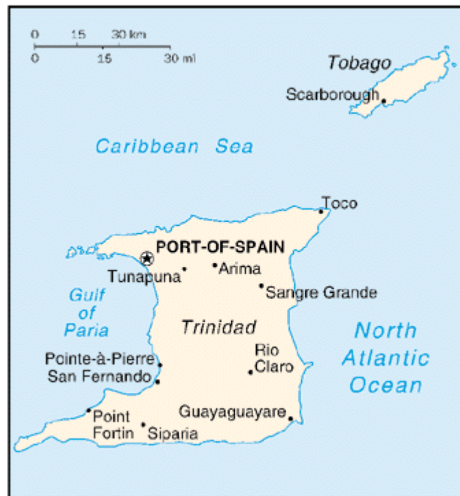
Figure 11: Map of the Republic of Trinidad & Tobago