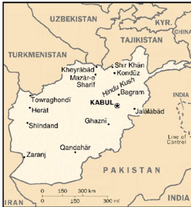
Figure 1: Map of the Islamic Republic of Afghanistan