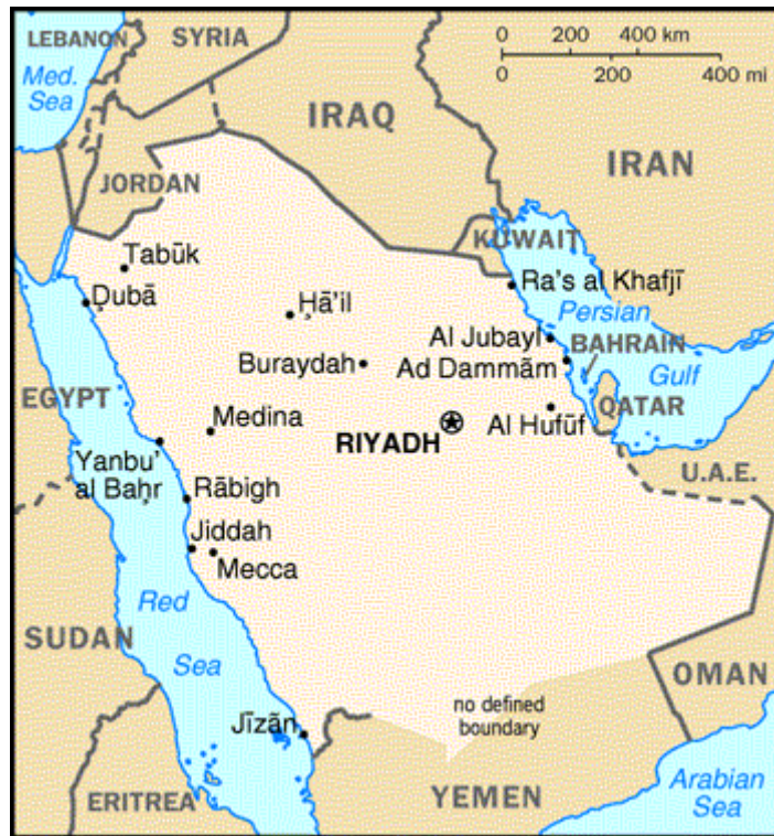
Figure 9: Map of the Kingdom of Saudi Arabia