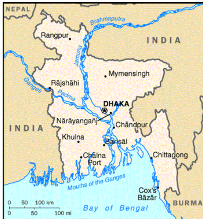
Figure 2: Map of the People's Republic of Bangladesh