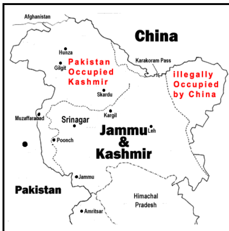
Figure 5: Map of Jammu and Kashmir region

lxxxiii