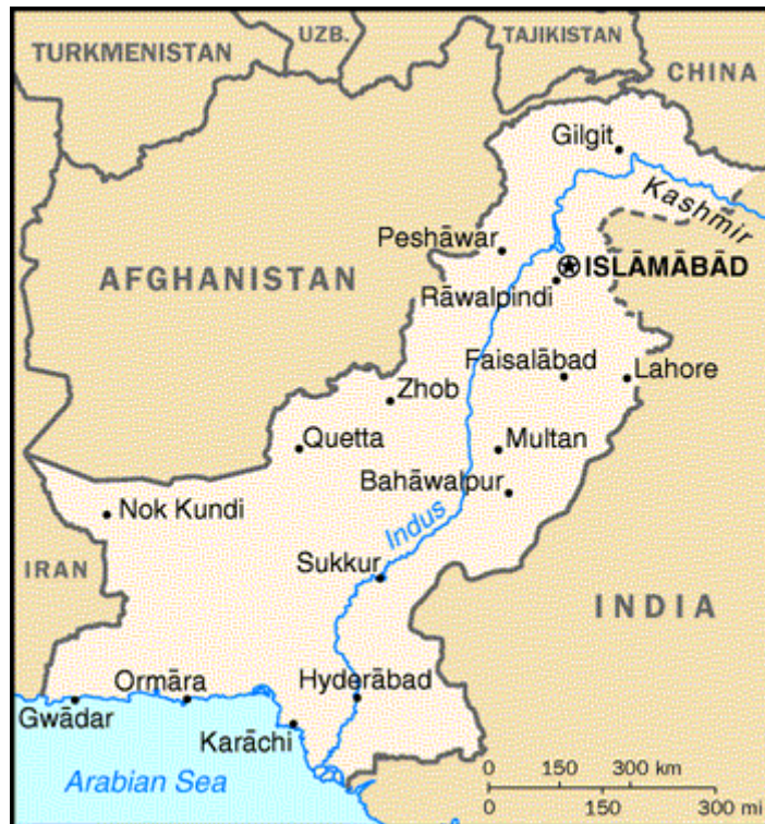
Figure 8: Map of the Islamic Republic of Pakistan