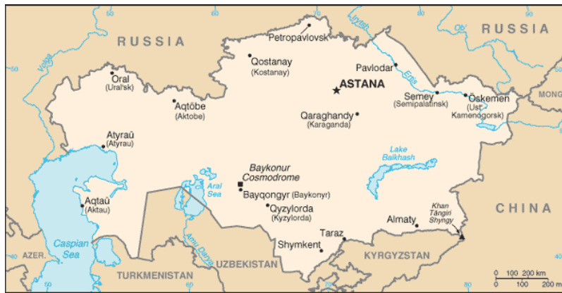
Figure 6: Map of the Republic of Kazakhstan