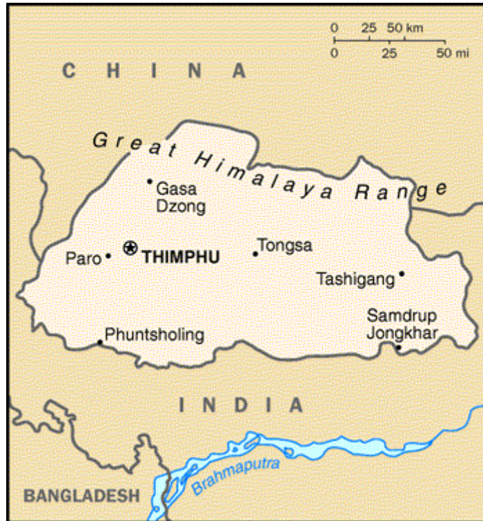
Figure 3: Map of the Kingdom of Bhutan