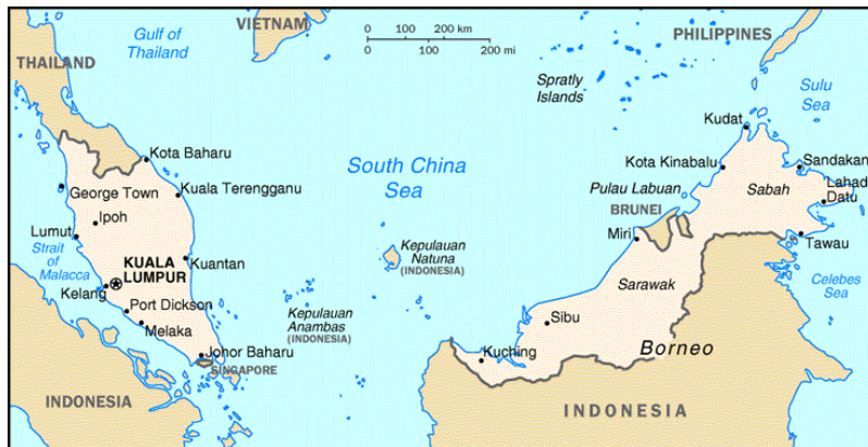
Figure 7: Map of Malaysia