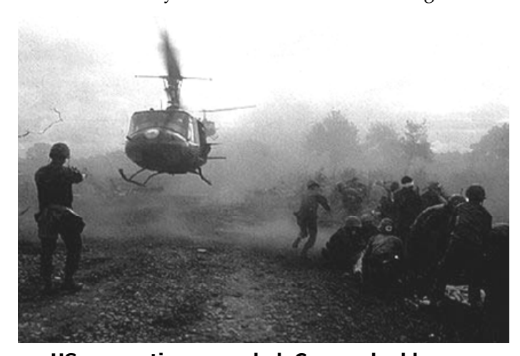
US evacuating wounded. Convoy had been ambushed on way to support an advanced camp.

There was no moon that night. Even alert guards might have had difficulty seeing the 50 men who suddenly emerged from the jungle and ran toward the gate. They were wearing the plain peasant clothing known to Americans as black pajamas. Each member of the village defense force was struck and knocked down from behind with a single blow. Their throats were cut and they were left to die. The guerillas captured the village chief, brought him in plain view for all in the hamlet to see. They killed the chief and his family, while denouncing Diem and the South Vietnamese government. They blamed Diem and his American advisors for forcing them into An loc in the first place. Then they dared the South Vietnamese Army to come to the aid of the village.